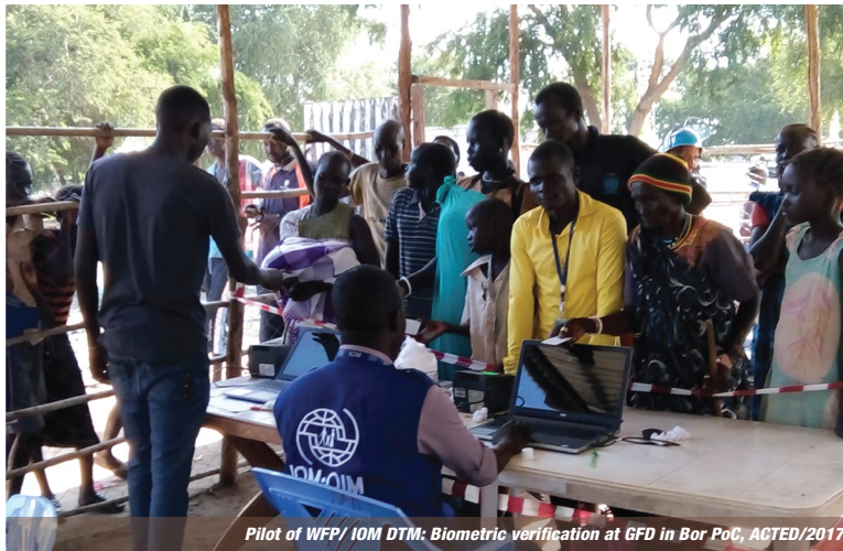
Pilot of WFP/ IOM DTM: Biometric verification at GFD in Bor PoC, ACTED/2017

NEW CCCM Online Training, CCCM Cluster invites all stakeholders to enroll at www.cccmllearning.org