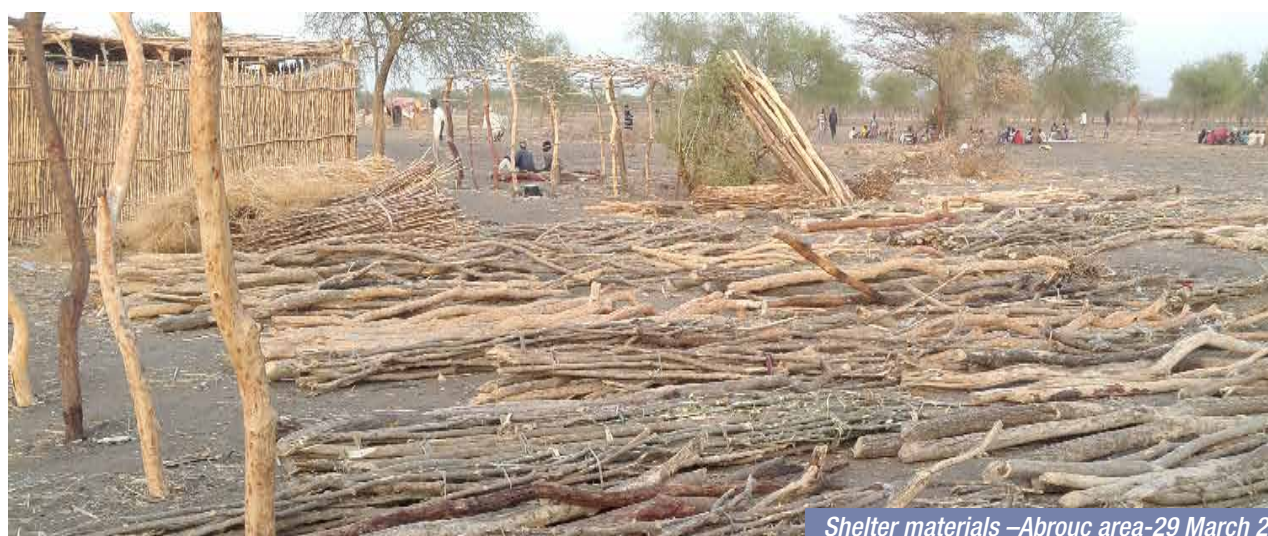
Shelter materials –Abrouc area-29 March 2017