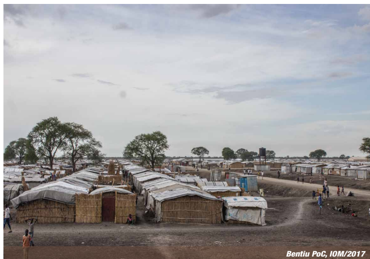
Bentiu PoC

NEW CCCM Online Training, CCCM Cluster invites all stakeholders to enroll at www.cccmllearning.org