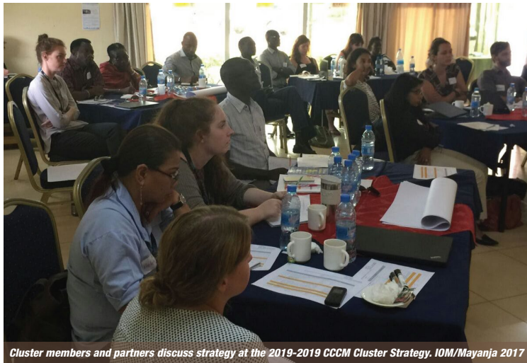
Cluster members and partners discuss strategy at the 2019-2019 CCCM Cluster Strategy

NEW CCCM Online Training, CCCM Cluster invites all stakeholders to enroll at www.cccmlearning.org