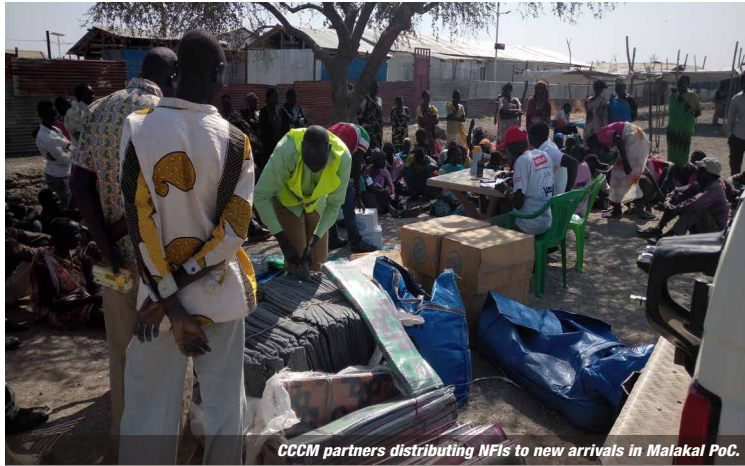
CCCM partners distributing NFIs to new arrivals in Malakal PoC.

NEW CCCM Online Training, CCCM Cluster invites all stakeholders to enroll at www.cccmlearning.org